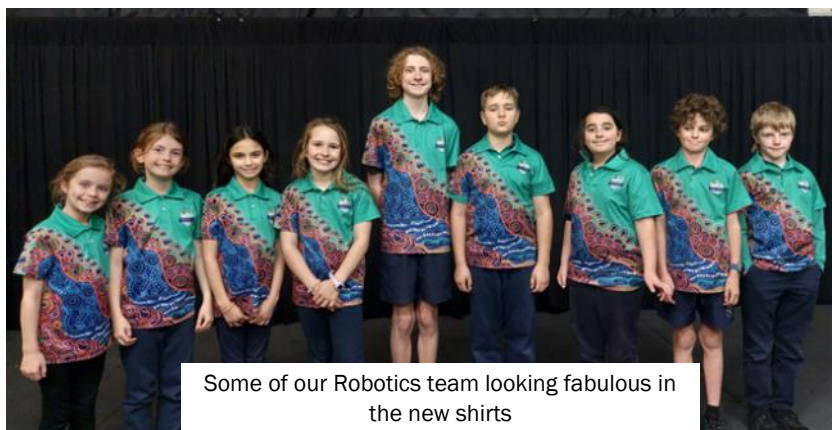
Some of our Robotics team looking fabulous in the new shirts

This week, we received our new Indigenous-themed shirts that we will wear on educational and sporting excursions. They incorporate an Indigenous design depicting Lesmurdie Falls (a design commissioned by the Falls Road P&C) along with the school colour, Jade (see picture below). We're sure they will really stand out on excursions outside the school. These shirts were funded by the Falls Road P&C.