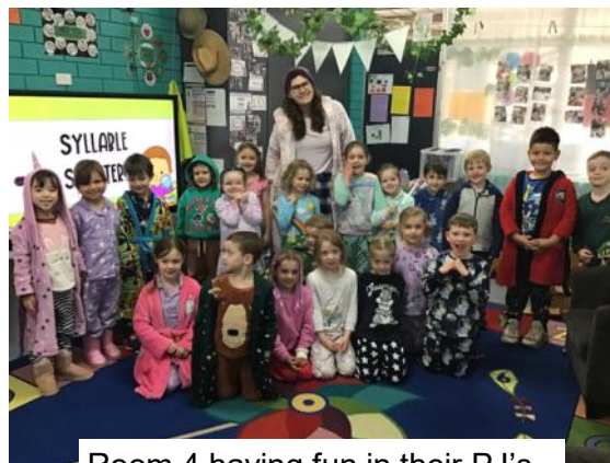
Room 4 having fun in their PJ's.

Teachers and students loved the chance to be extra snuggly in their Pj's in Week 1, in recognition of National Pyjama Day. We raised a total of $287.80 from the gold coin donations we received from everyone who participated. These funds will go towards helping children in Foster Care.