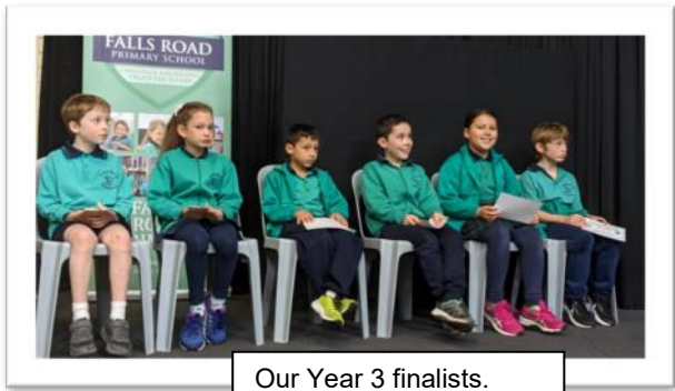
Our Year 3 finalists.