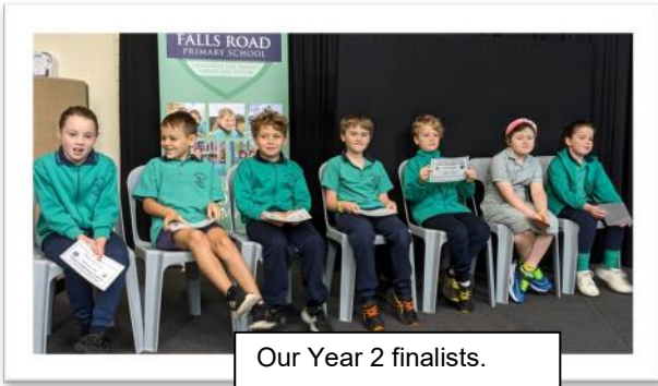
Our Year 2 finalists.