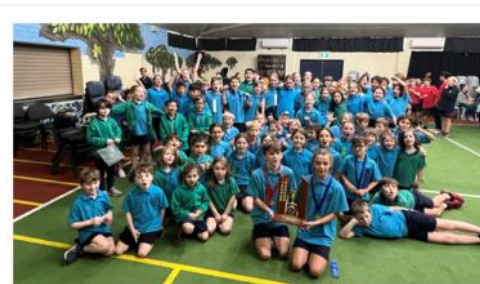
Blue Faction Cross Country team

One of my favourite events in schools is the Cross Country. It is an opportunity for students to dig deep show their resilience and courage in what is not natural for many, and that is to run a long distance on an up and down surface. Congratulations to every participant who represented their faction, and a special acknowledgement to those who shone on the day and won medals. I look forward to hearing how we perform at the upcoming Interschool event.