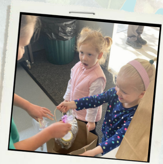
Our best Mother's Day Helpers - thanks girls :)