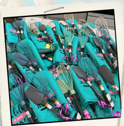
Some beautiful Mother's Day gifts ready to be purchased