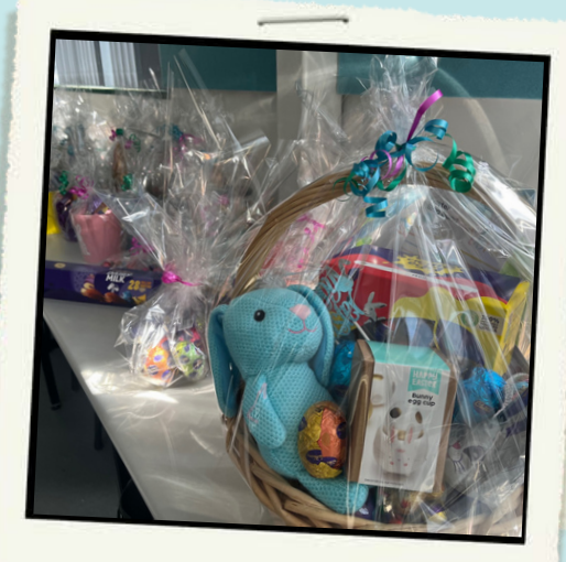
Easter Raffle prizes ready!

Some of this hard earned money will be going towards funding the Year 5 students to attend a Constable Care Bike Safety school excursion to raise awareness of bicycle safety and improve road awareness.