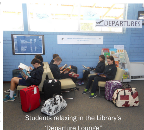
Students relaxing in the Library's 'Departure Lounge'

Our annual Book Week Parade is happening next Friday, 25 August in the Moonlight Hall, starting at 8.45am. This is a great chance for students, teachers and parents to dress up as their favourite book character. Students will parade around to music and there will be some impromptu interviews of students about their character and their favourite book. It's a great idea to bring along a copy of your favourite book.