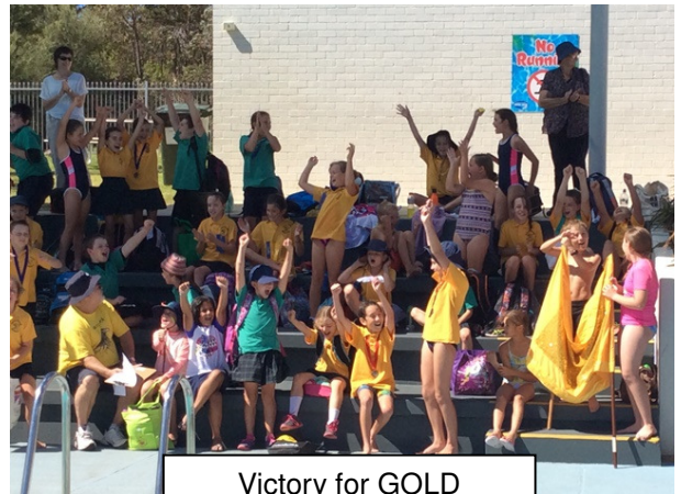
Victory for GOLD