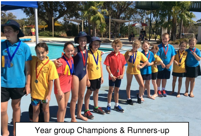
Year group Champions & Runners-up